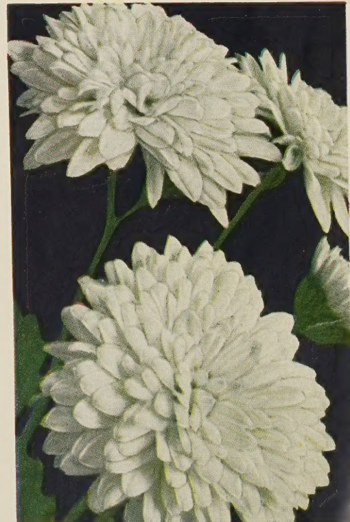
PAPER WHITE. 50c each; 3 for $1.25